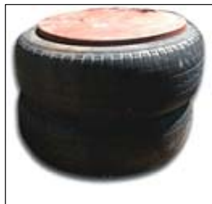
Stack of tyres