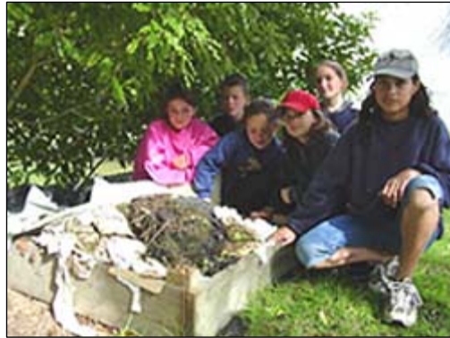
A wooden frame