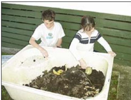
An old shower tray