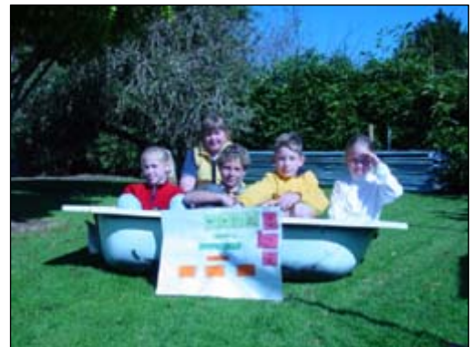
An old bath tub

You should ensure that you include a lid in your wormery design to give the worms the dark environment that they prefer and to protect your wormery from predators attracted to the food waste. Old carpet, hessian or some plywood can make a good cover. The tighter the seal on the lid the more likely you will find your bin staying on the moist side.