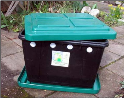
A plastic storage box

Some examples of home-made wormeries are shown below.