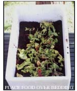
A polystyrene box